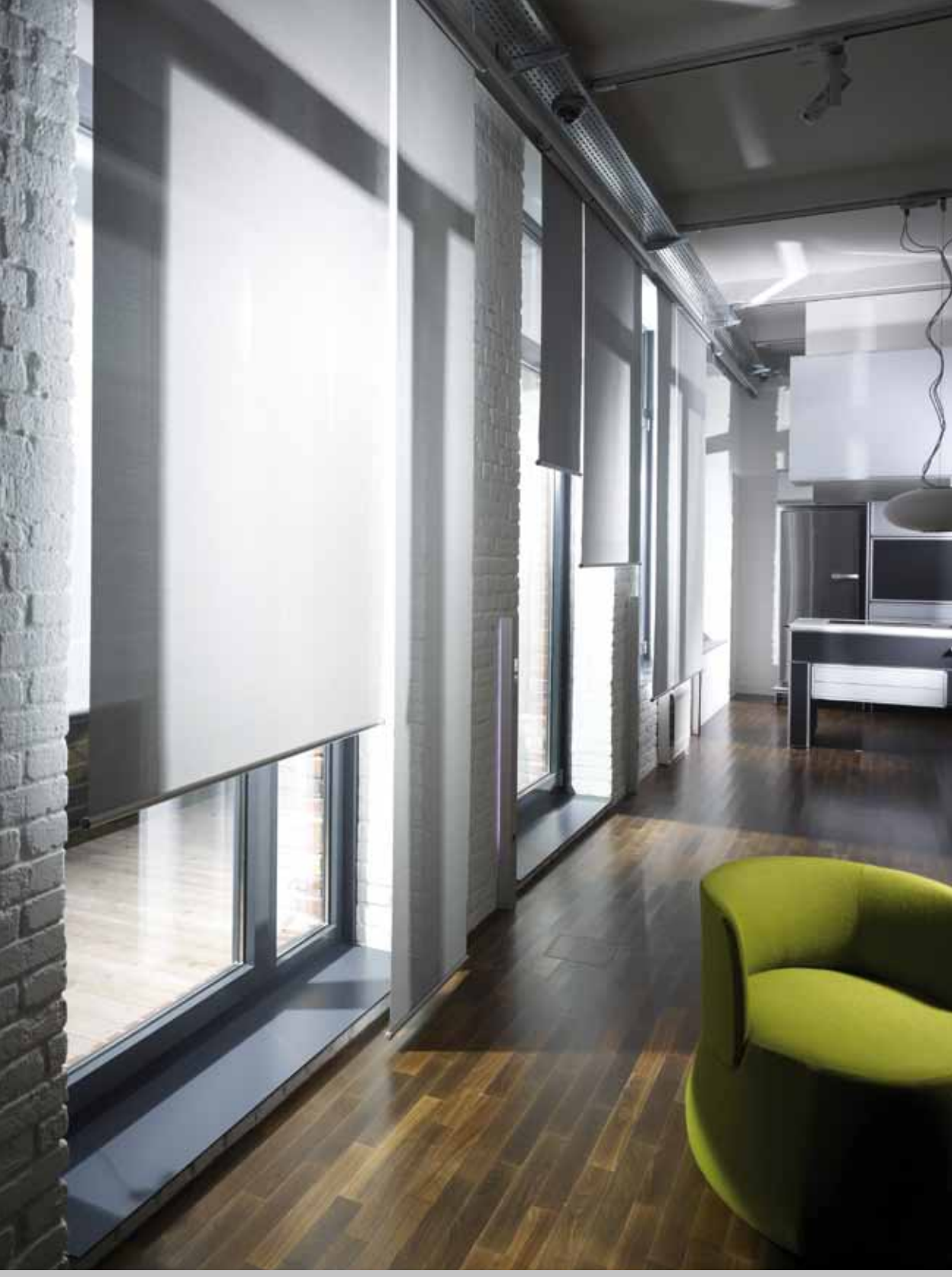
Roller Blind System Silent Gliss 4860