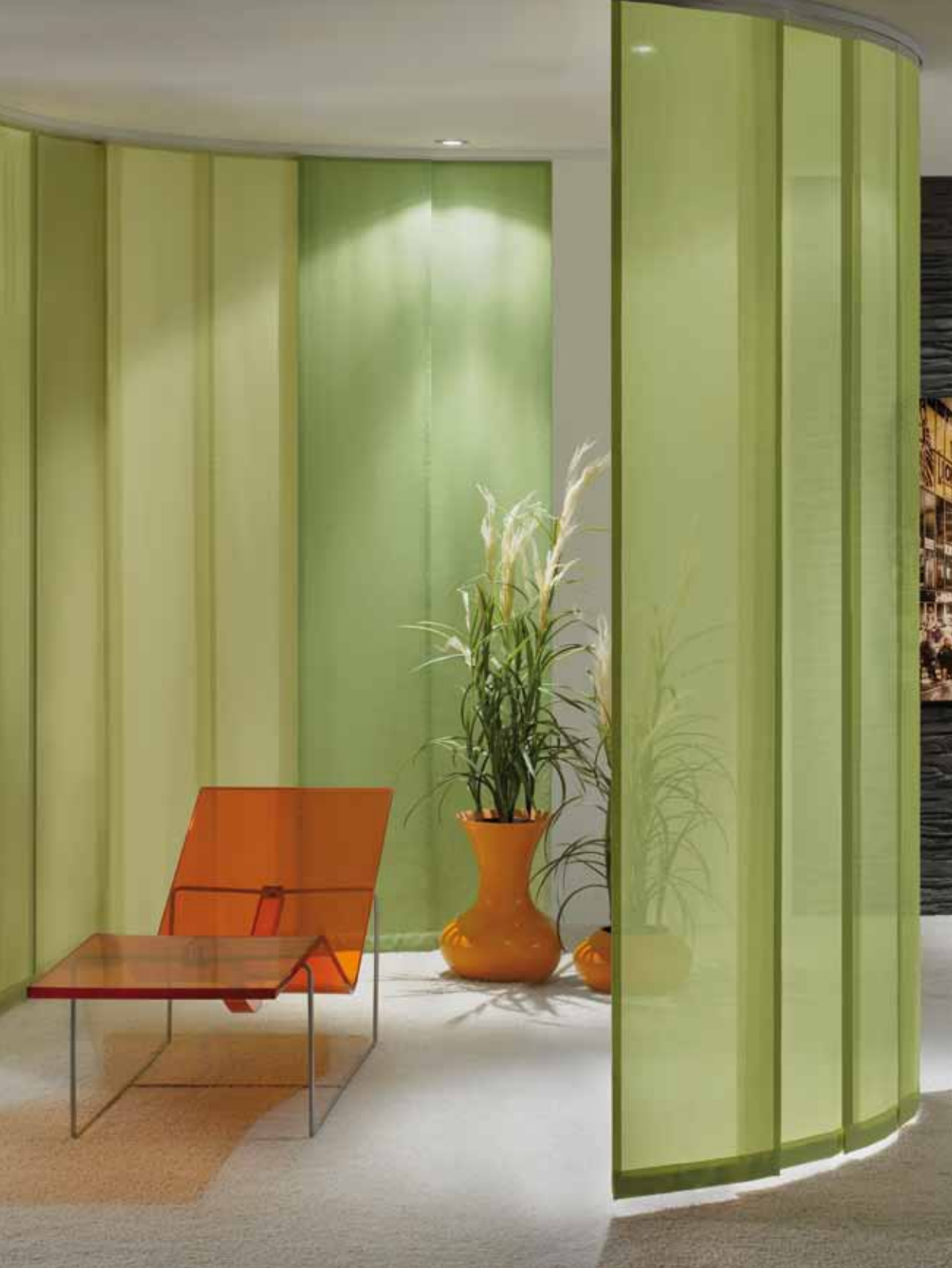
Curved Panel Glide System Silent Gliss 2730 Flex